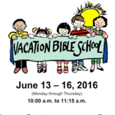
MARKET STREET CHURCH OF CHRIST 514 WEST MARKET STREET ATHENS, ALABAMA